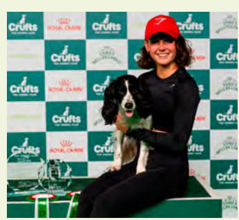
Crufts YKC Agility Dog of the Year winner Summer and Arrow