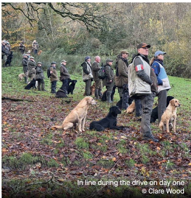
In line during the drive on day one

Retrieves were varied, some down into or across a goyle, others though banked hedges, picking in woodland or out of reeds and bracken.