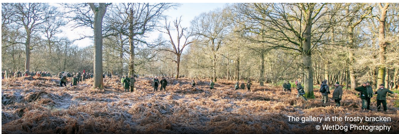
The gallery in the frosty bracken