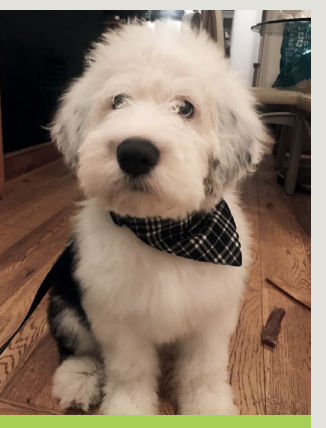
I love my dog because this little bundle of fluff is the best thing that ever happened to us.