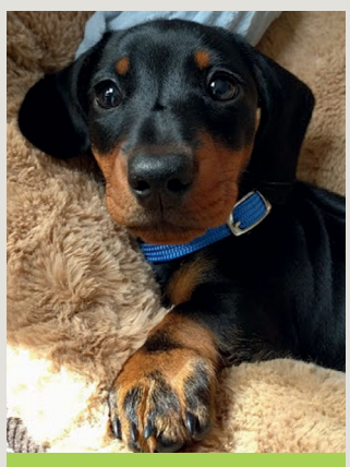
I love my dog because of the way he looks at me, his playful nature and his unconditional love!