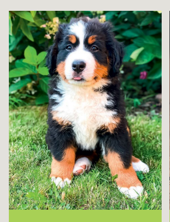
Our dog is the light in our lives. Would always recommend a Kennel Club assured breeder.

Owners who buy from a Kennel Club assured breeder spend nearly 20% less in vet bills* compared to those who buy a dog elsewhere.