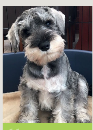
love my dog because she is my devoted best friend.

For a healthy, happy puppy always buy from a Kennel Club assured breeder and do your part to help put puppy farmers out of business.