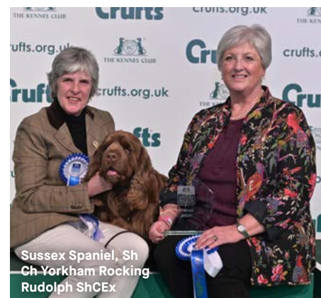
Sussex Spaniel, Sh Ch Yorkham Rocking Rudolph ShCEX

Dogs of breeds which are on The Kennel Club's vulnerable British and Irish breeds list who win Best of Breed at the above shows will qualify for the competition and will be invited to compete in the grand final at Crufts 2022. In cases where the Best of Breed winner is unable to compete in the final, the Best Opposite Sex winner will be invited.