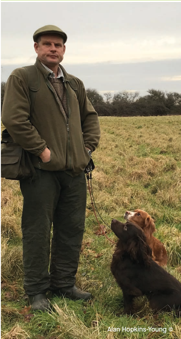
Alan Hopkins-Young ©