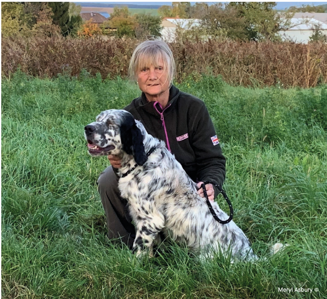
Meryl Asbury ©