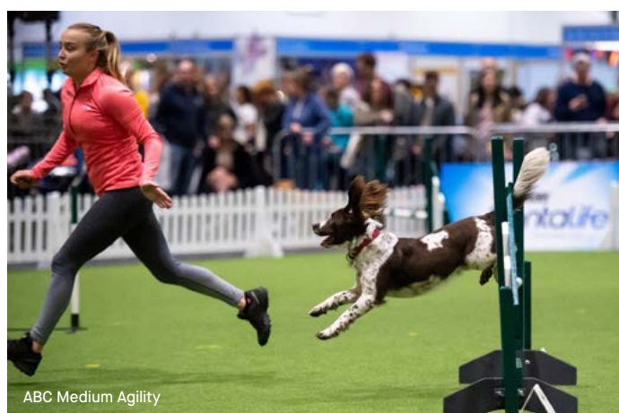
ABC Medium Agility

Discover Dogs provides something for everyone