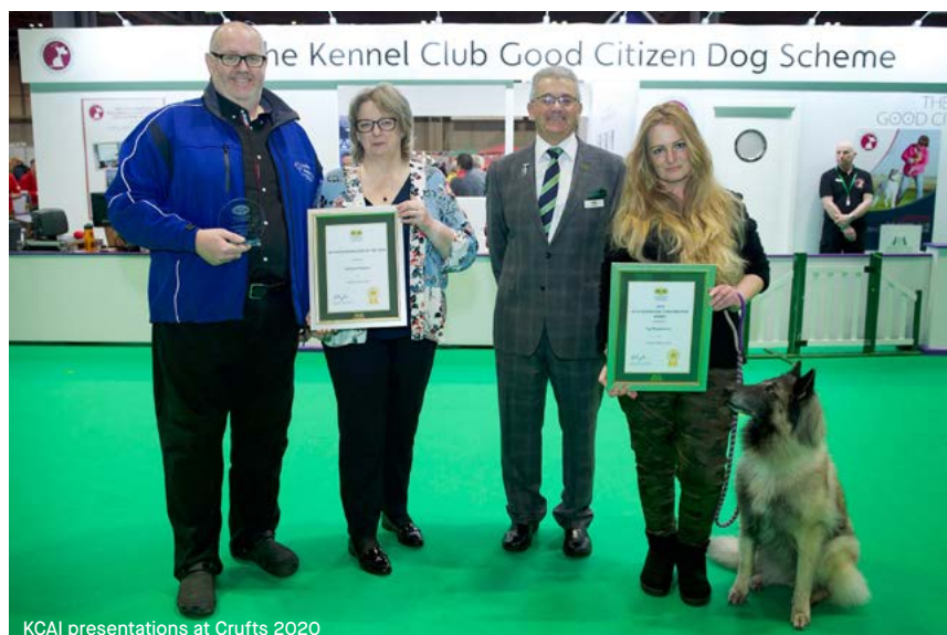
KCAI presentations at Crufts 2020

If you would like to receive a copy of the Kennel Gazette why not become a Kennel Club Affiliate? Along with all the great content included within the Gazette, being an Affiliate entitles you to 10 per cent off all Crufts and Discover Dogs tickets, 10 per cent off all Kennel Club merchandise and publications all year round, annual copy of The Kennel Club Year Book and more.