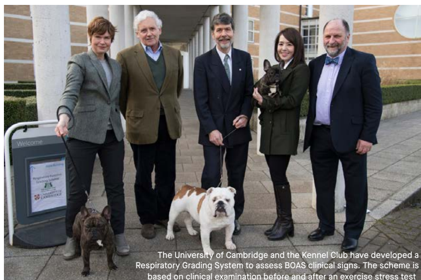
The University of Cambridge and the Kennel Club have developed a Respiratory Grading System to assess BOAS clinical signs. The scheme is based on clinical examination before and after an exercise stress test