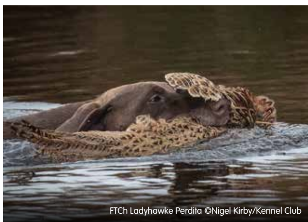
FTCh Ladyhawke Perdita