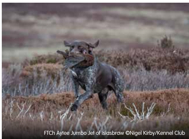
FTCh Aytee Jumbo Jet of Islasbrow