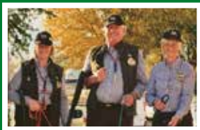
Team GB and St. Hubert Spaniels with their Captain