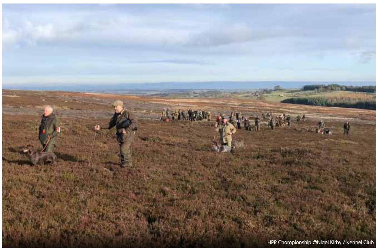
HPR Championship