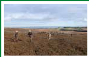
HPR Championship