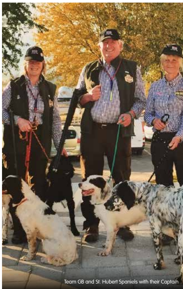
Team GB and St. Hubert Spaniels with their Captain

and stopwatches, under FCI Rules. It was a great experience and we saw some exceptionally good dogs.