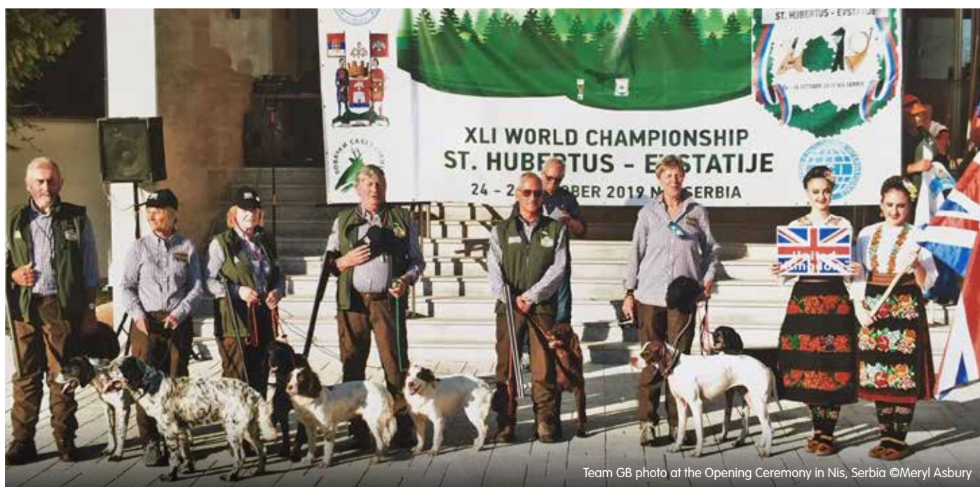
Team GB photo at the Opening Ceremony in Niš, Serbia