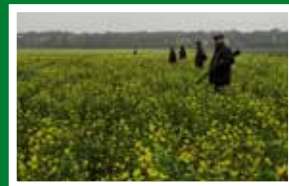
Two Day Open AV Retriever stake