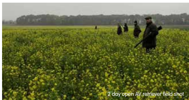
2 day open AV retriever field shot

Third and fourth places were not awarded