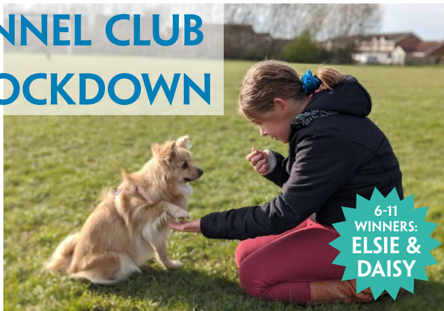
6-11 WINNERS: ELSIE & DAISY