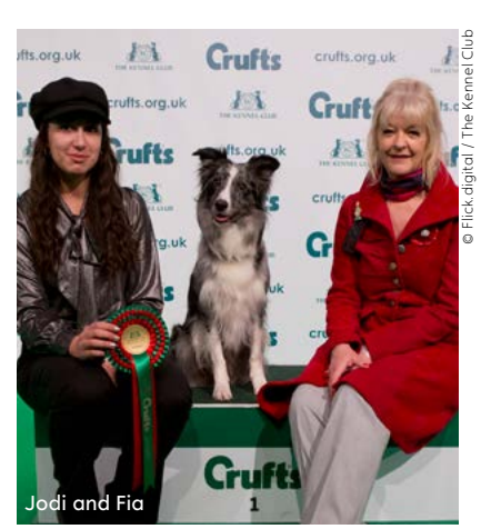
More news >>>