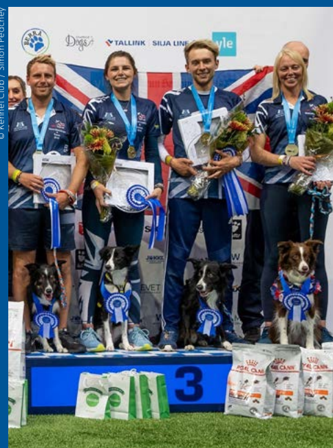
The GB High Hopes agility team

The GB High Hopes team has won an overall bronze medal in the Large team competition at the FCI Agility World Championships, after competing against 33 other teams.