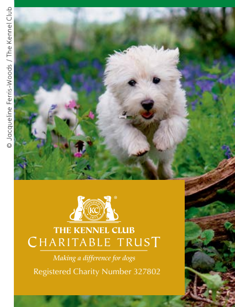
© Jacqueline Ferris-Woods / The Kennel Club