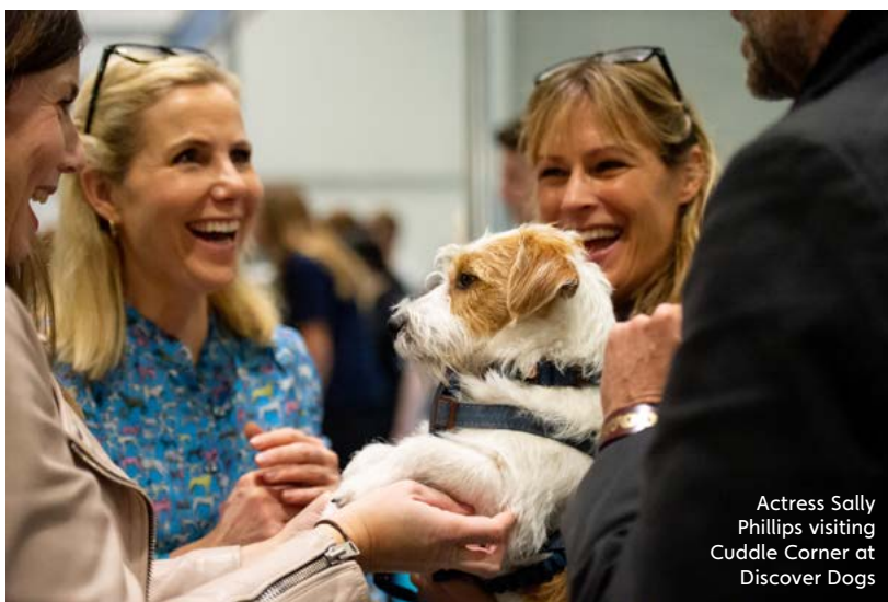
Actress Sally Phillips visiting Cuddle Corner at Discover Dogs